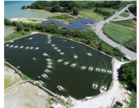
Figure 1. Overview of a shrimp farming pond.

Keywords: Aquaculture, eNAs, sustainability, disease prevention, Okinawa