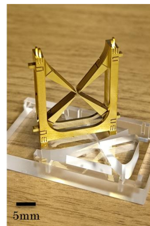
Figure 1. A gold-plated 3D printed ion trap on top of the glass substrate it was machined out of.

Keywords: Quantum Computing, Quantum networking, Quantum Internet, Ion trap, Cavity Quantum Electrodynamics