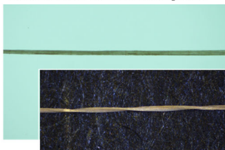
A fiber from young Itobasho plant, twisted morphology