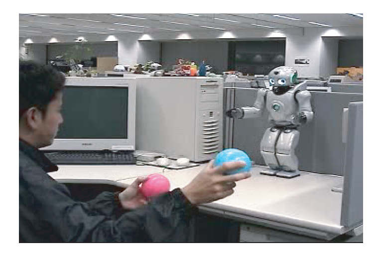
Figure 1: A user is interacting with the Sony humanoid robot QRIO SDR-4XII.