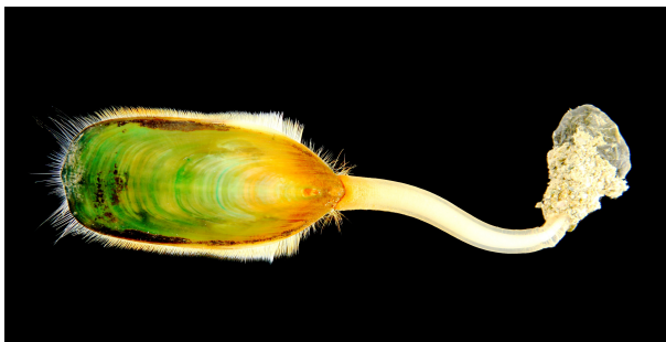
Photo1 Brachiopod, Lingula anatina